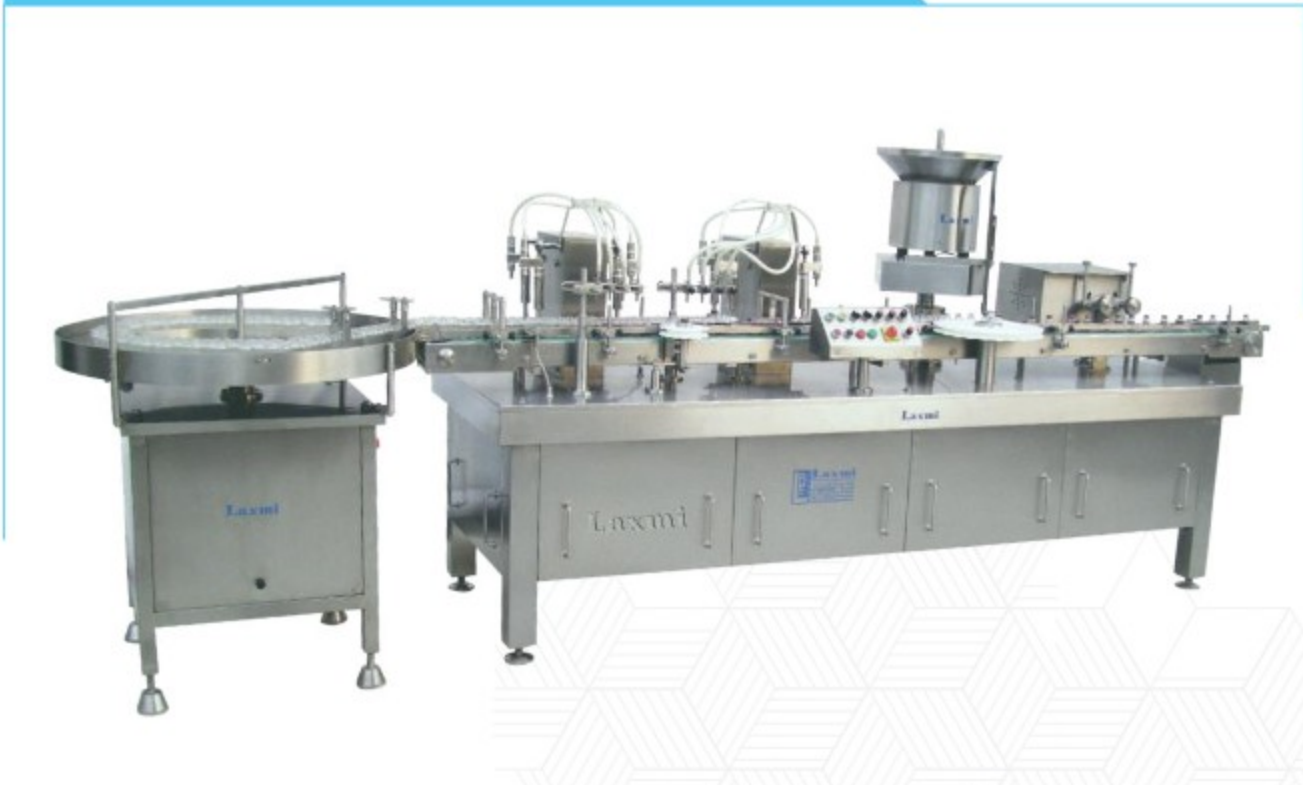
Model – LVFS 200R