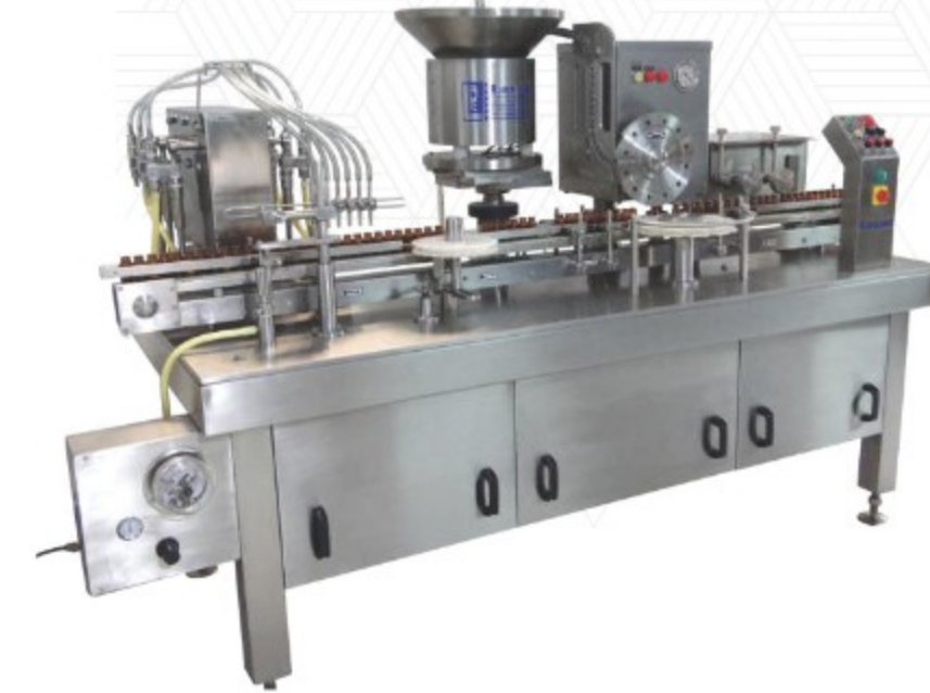
Model – LVFS 100V / 150V / 200V