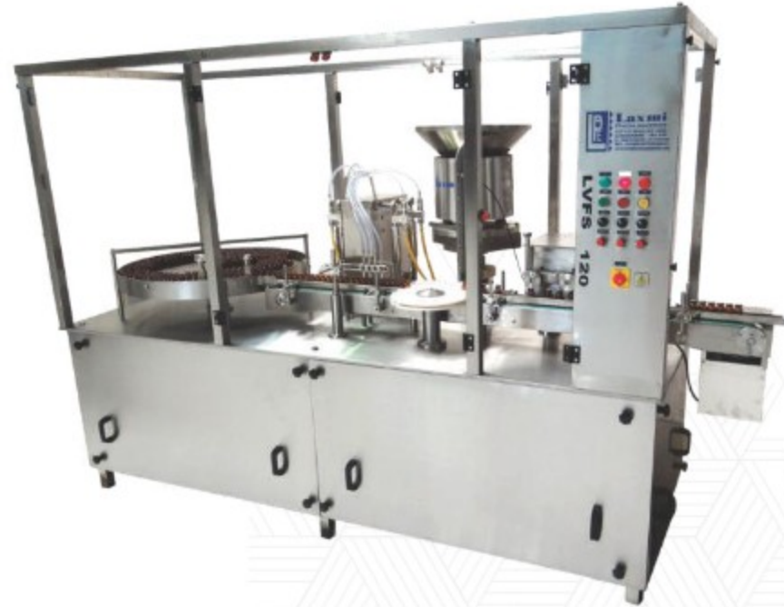
Model – LVFS 120 N