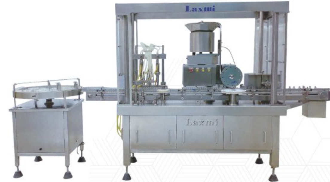
Model - LS 200