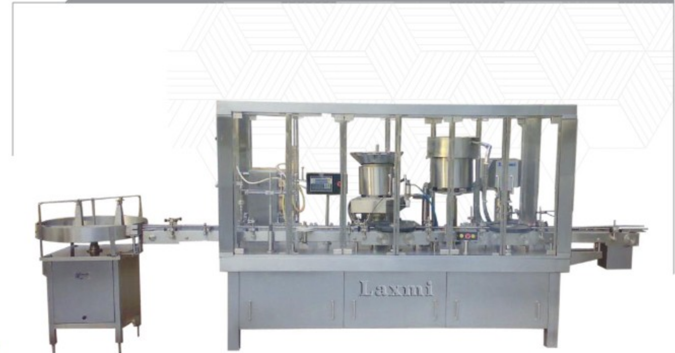
Model – LBFS 40 (2 Head) / LBFS 50 (4 Head)