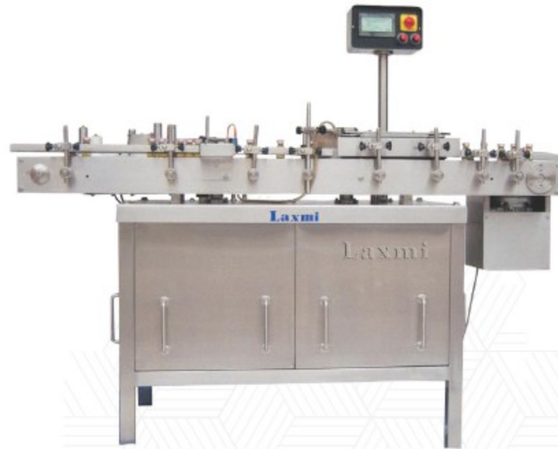
Model – LSL 100 / 200