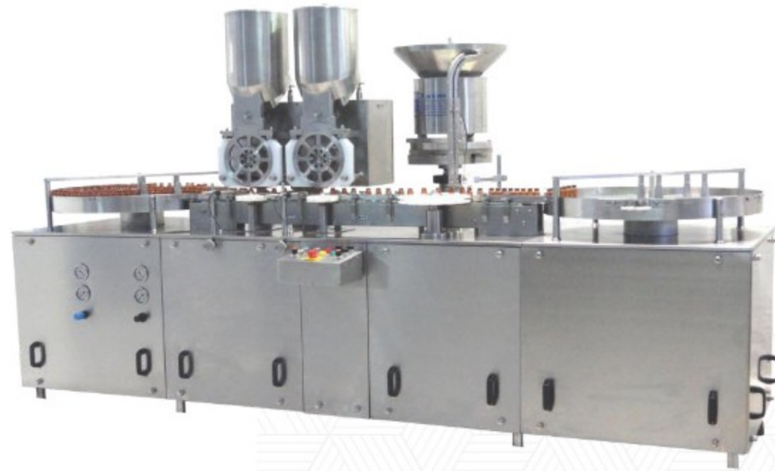
Model – LPFS – 240