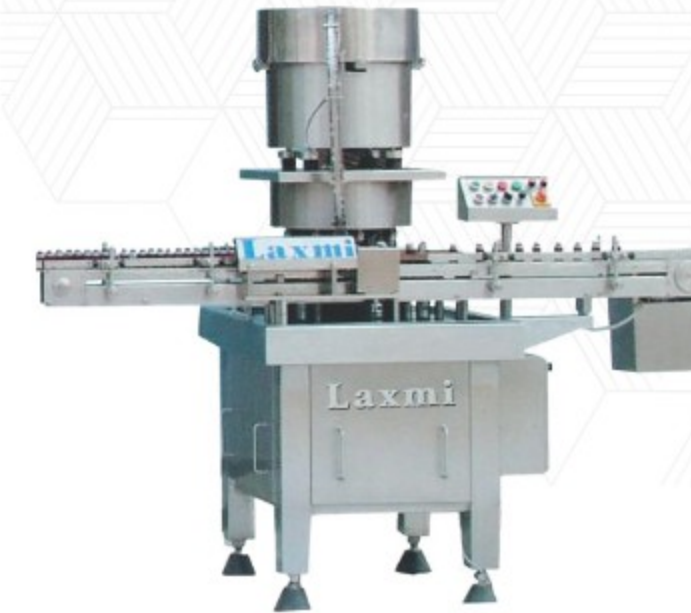
Model – LACS 200 / LACS - 150